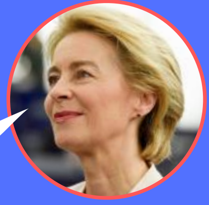
PRESIDENT OF THE EUROPEAN COMMISSION - URSULA VON DER LEYEN STATE OF THE UNION ADDRESS 2020

"WE WILL MAKE SURE THAT PEOPLE WHO HAVE THE RIGHT TO STAY ARE INTEGRATED AND MADE TO FEEL WELCOME. THEY HAVE A FUTURE TO BUILD - AND SKILLS, ENERGY AND TALENT."